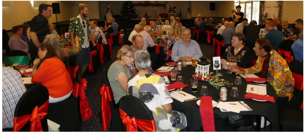
The Annual Thank You Volunteers Dinner at the West Adelaide Football Club, was enjoyed by all