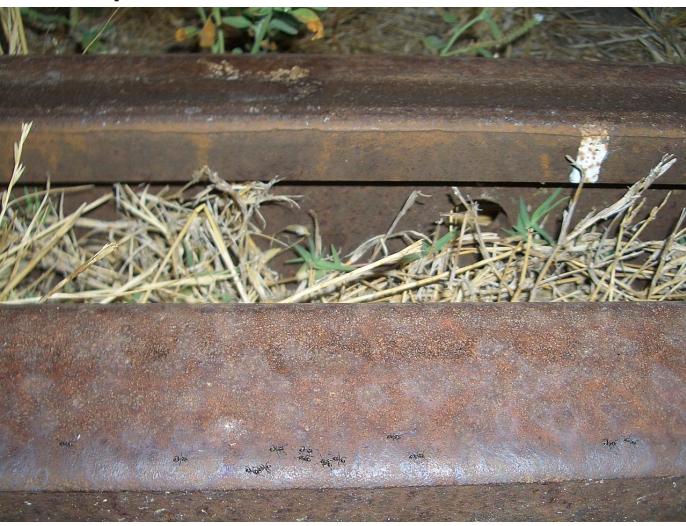
Rail - Ant path

Semi-abandoned rail tracks in Kadina (Yorke Peninsula, South Australia) are now mostly used by the ants. Ants, being social insects, have been able to reuse rail tracks abandoned by humans for their own transportation (The rails pictured are two rails on the same side of the track: this is the dual-gauge rails, with the outer rail for the Irish gauge, and the inner, rustier one, for the standard gauge)