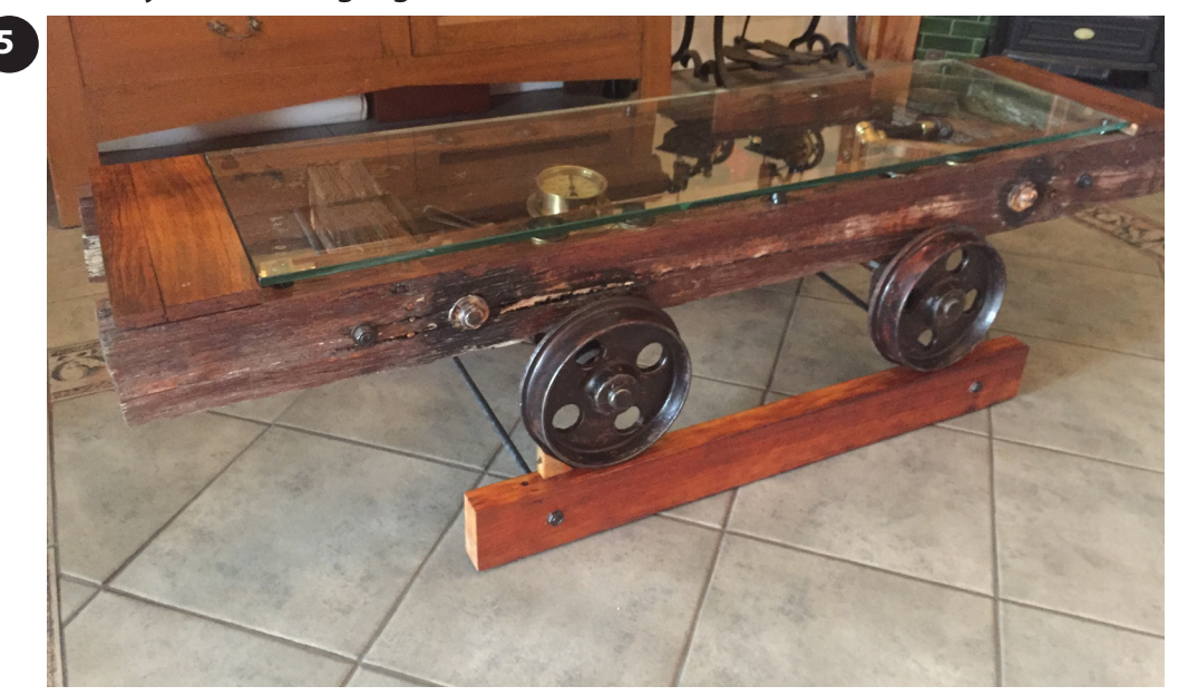
Coffee table built using a 2' gauge railway wagon frame. Artist Rob Sanders