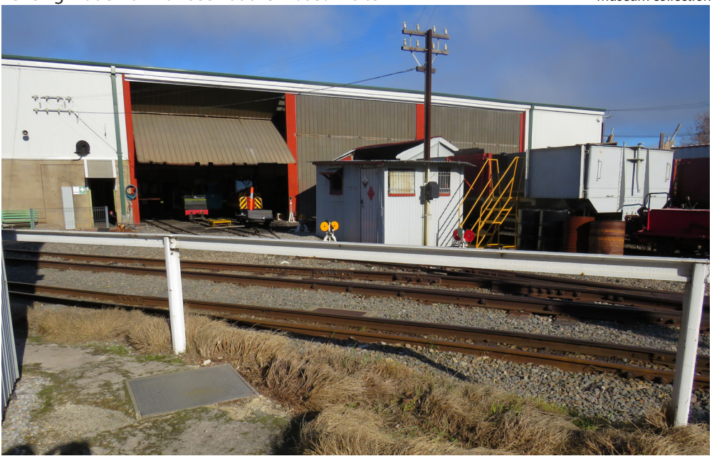
Example of rail being used as a simple fence. Rail was used due to its easy availabilty, cost-effective and hard-wearing properties.