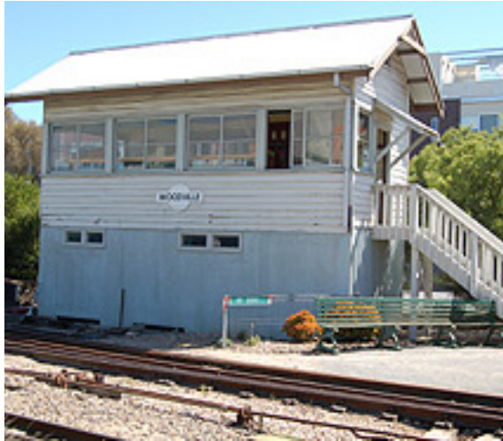
Woodville signal cabin

The former Woodville signal cabin of the South Australian Railways/State Transport Authority has been re-located to the Museum site and connected to the narrow gauge yard on the western side of the Museum site. It is available for tours.