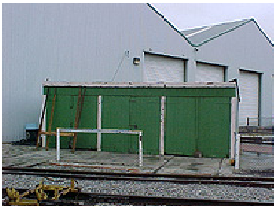
Eudunda gangers shed

Located at rear of the Ron Fitch pavilion is the former Eudunda Gang Shed. A ganger was in charge of the fettlers, who worked on the train track. Track work tools are stored in the shed.